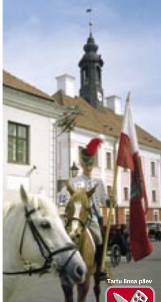
Tartu linna päev