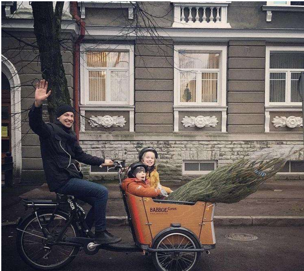
Bringing home the family Christmas tree ... The photo shows a Trike type cargo bike.

Cyclists also save on healthcare costs. Cycling on a daily basis helps you maintain your overall physical shape and saves money spent on infrastructure, as the costs of building and maintaining cycle paths are more favourable in the long run than developing a car-centric urban environment.