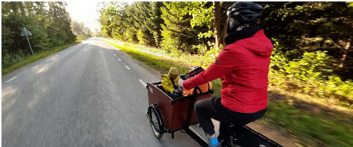
Out of town. The photo shows a Trike type cargo bike.

Cargo bikes are available as both regular and electric. Electric bicycles make moving about convenient, even if you want to transport a heavy load or if the journey is not level.