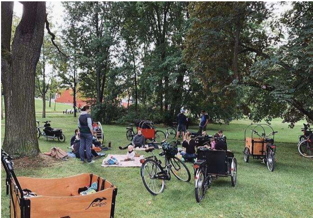
Summer get-together in the park. With a cargo bike it is convenient to bring everything necessary and pleasant along with you. The photo shows Trike and Long John type cargo bikes.

Health and well-being. Several studies have revealed the positive effect of cycling on the prevention of cardiovascular diseases and cancer, as well as on mental health 1 . Cargo bike users note that moving about on a cargo bike allows you to enjoy the time it takes to move from one place to another. Usually, children also like riding with cargo bikes, which means that they can be transported to the fresh air, kindergarten, and school in a good mood. When riding a cargo bike, you will also notice new and interesting things in the urban space. Noticing the urban space offers interesting experiences, social contact, and a connection with the community – all of which contribute to people's overall well-being. Exercise with a cargo bike is a good option for keeping yourself in good general physical health while at the same time carrying out your necessary daily activities.