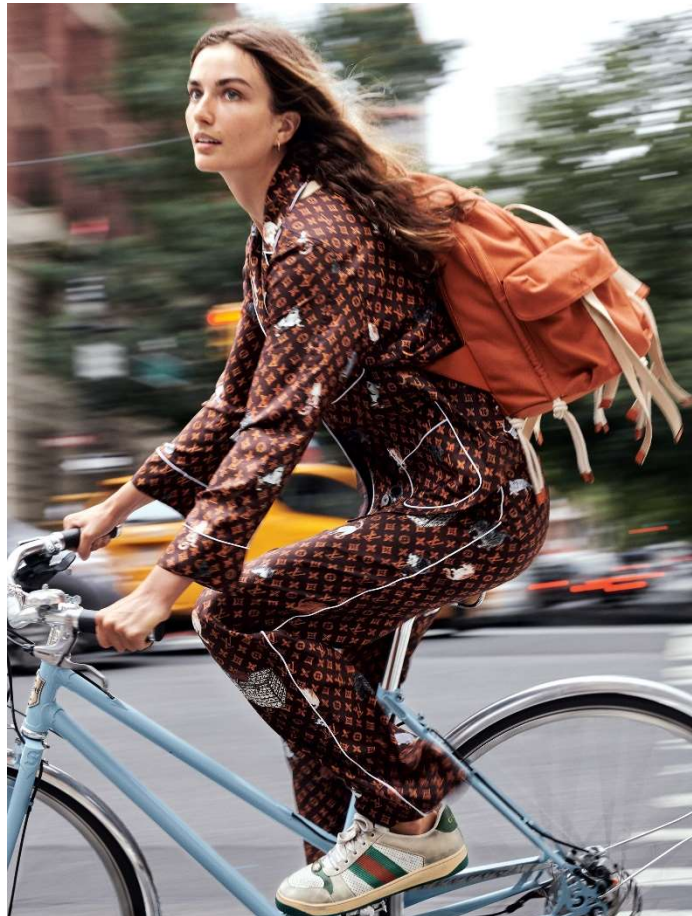
Photo from an article in the fashion magazine Vogue about cycling style and suitable clothes.

Symbolic and visual values. Daily cycling to school, a café, a cinema, or a grocery store can also provide an opportunity for artistic expression through style. Why not ride in heels or creased trousers, exactly the way that you want to express yourself through style that day. The bike itself can also be an element of style. Many users have noted that being able to use a cargo bike leaves them with a sense of freedom. In the Netherlands, for example, cargo bikes are associated with independence and professionalism, especially for women.