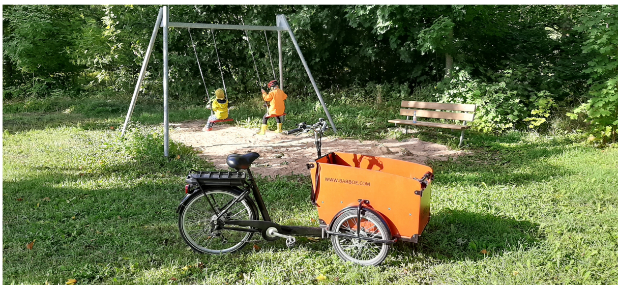
To the playground with a cargo bike. Depicted in the photo is a Trike type cargo bike. Author: Wout Verlinden