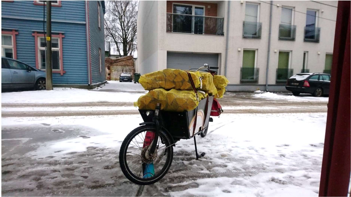
Fireplaces do not remain unheated. A load of firewood on a cargo bike.

not make the driving experience uncomfortable. A cargo bike can be fitted with a weatherproof cover that protects objects and children from the rain and also provides the rider with a windscreen.