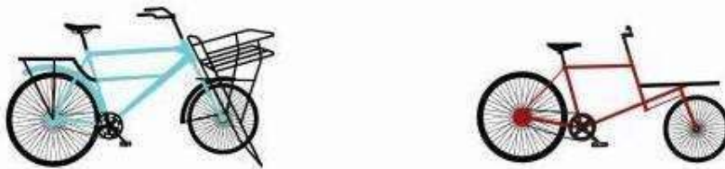
Hybrid bikes. Illustrator Karen Rike Greiderer.

Hybrid bikes – Most similar to a regular bike, and in the street they may look like ordinary bikes, but hold more. The cargo rack or basket is located in front of the handlebars. Used mainly to transport cargo.