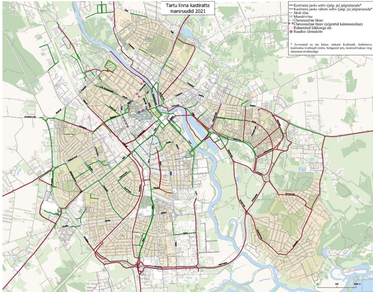
Map of Tartu's cargo bike routes.