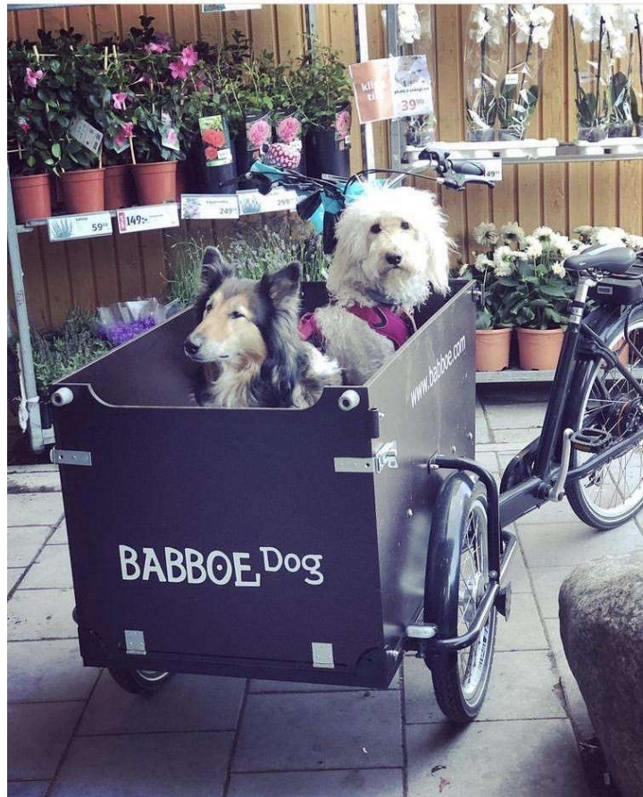
In a flower shop with pets.

‘The cargo bike also allows you to transport the family's weekly shopping bags or plants and bags of soil home from the garden centre. In short, you do not have to think about what and how much to buy and how to get home when you are in the store.’