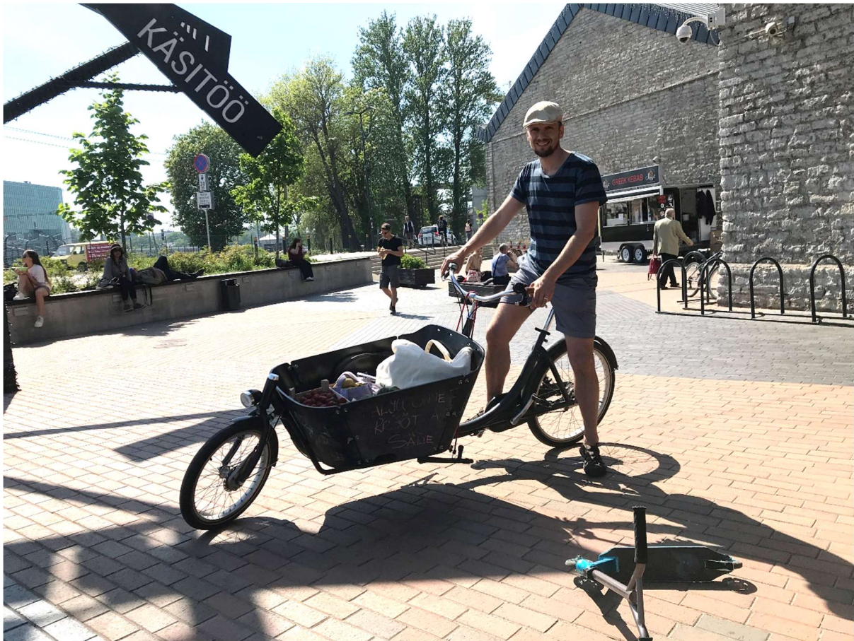
Summer day at the Baltic Station Market.

Cognitively, there are more cargo bikes on the street in our neighbouring countries as well as in Tallinn and Tartu. A number of social media communities have been formed around the world, who share their daily activities on a cargo bike, discuss problem areas, and share tips with other users. In Estonia, such communities include a Facebook group called Kastiratas, and an Instagram user with the same name.