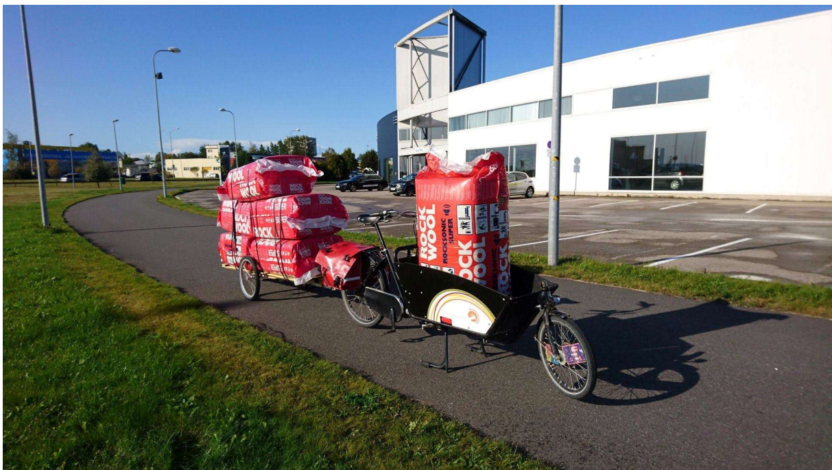
Transport of construction materials on a Long John type cargo bike. A trailer is also connected to the bicycle. Author: Hannes Lents

As a result, there are more opportunities to create a safer, more exciting and greener public space, which in turn increases social cohesion, improves business turnover, and motivates people to move about more and thus maintain their health.