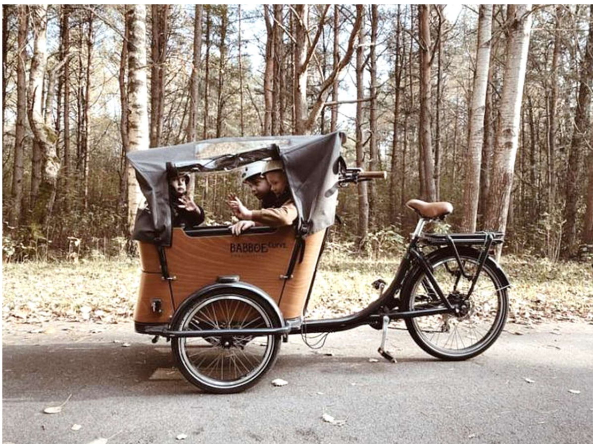
Three children on a cargo bike. The cargo bike is fitted with weatherproof protection.

Awareness of the benefits offered by the cargo bike is gradually growing. The cargo bike is not yet a common alternative to a car in Estonia. However, each user makes this option more visible, and as the number of users increases, so does speed at which barriers are resolved. For example, the use of cargo bikes in Finland has markedly increased in recent years.