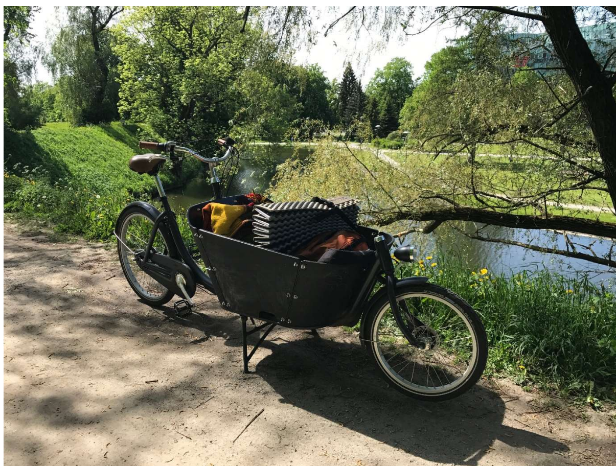
To a picnic. Depicted in the photo is a Long John type cargo bike and the items are secured with straps for safe transport.