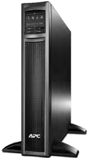
[ SMX1500RM12U ]

Convertible extended run models ideal for critical servers and voice/data switches.