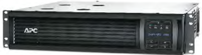
[ SMT1500RM12U ]