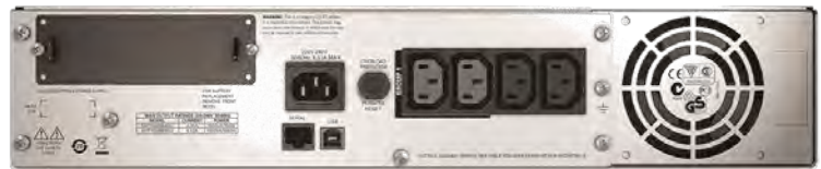
[ SMT1500RM12U ]