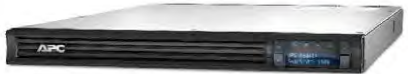
[ SMT1500RM11U ]