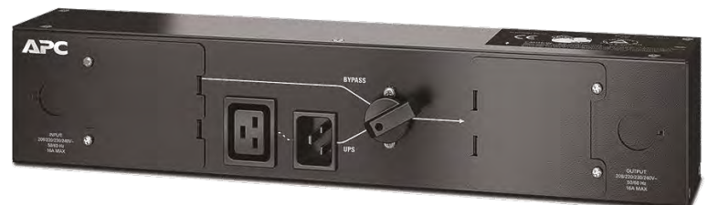
[ SBP3000RM ]

SBP3000RMHW: APC Service Bypass Panel, 100 - 240 V; 30 AMP ; BBM; Hard-wire Input/Output